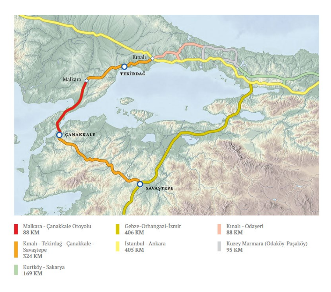
Figure 1. Overview of the Kınalı - Balıkesir Motorway Project

The Project is part of the wider Kınalı – Tekirdağ – Çanakkale – Savaştepe Motorway (shown in Figure 1 ) with a length of 324 km, which is one of the key projects for national development.